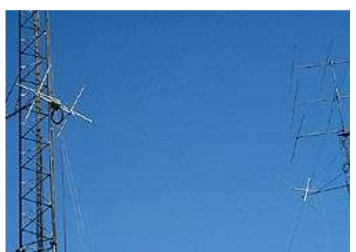
One half of the new 75/80-meter cage antenna going up at W1AW. The antenna is suspended on three of W1AW's towers.

NEWINGTON, CT May 3, 2001--Good ideas seem to have a way of coming back into style. Joining the W1AW antenna farm this week is an 80-meter "cage" dipole. The new antenna is not too different from ones used in the early years of Amateur Radio--including during the transatlantic tests of the early 1920s.